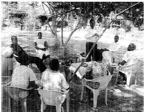
Table banking group in operation

The demonstration greenhouse at Karibuni is functioning and tomatoes are being produced and sold. In addition, basil, bulb onion and kales are being planted. In addition to the greenhouse, a nearby open plot is being cultivated and 21 raised paddocks have been created for vegetable diversification with plans to plant onions and water melons at the start of the rainy season.