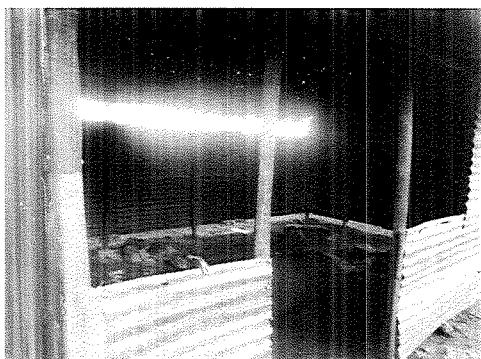
Bongu's old kitchen